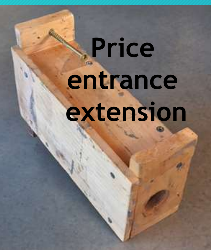
Price entrance extension